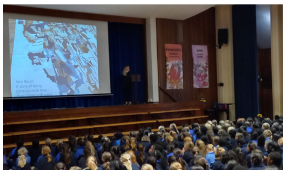
Amy Rusch (E08)