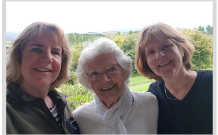
Pictured Mother and Daughter alumnae.