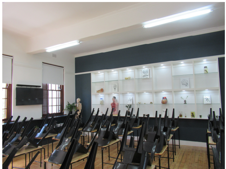
Science room so far: needing new workstations and connections

The Science Room Project will be an extra undertaking as the RA Committee will continue with awarding and increasing scholarships to learners from our limited funds.