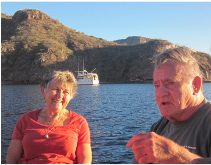
(Picture taken earlier this year on holiday in Mexico with her husband)