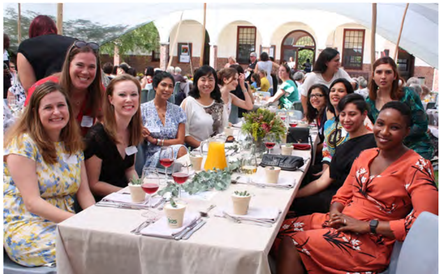
Matrics of 1999 celebrating their 20-year reunion