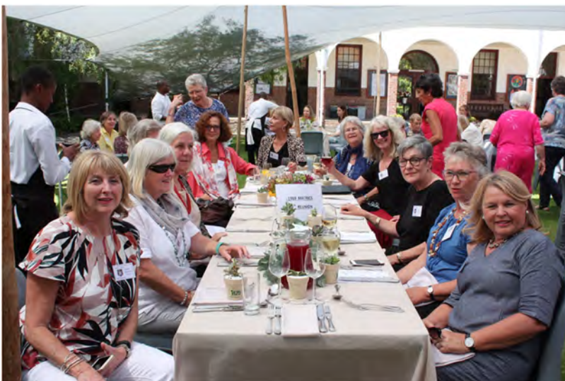
Matrics of 1969 celebrated their 50-year reunion