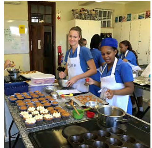
The girls of Bon Appetit whipped up delicious tea-time treats to be enjoyed by the alumnae before assembly