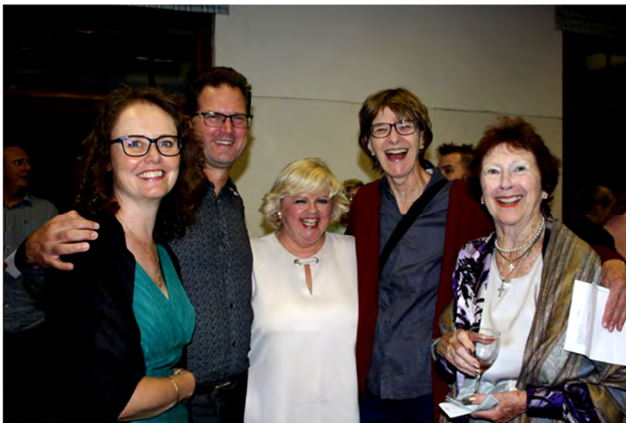
At the Kaleidoscope of Music concert