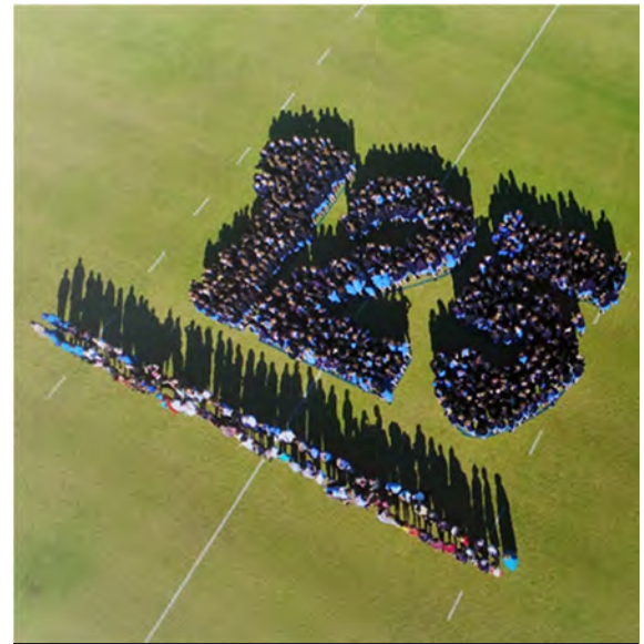
125 years of RGHS were celebrated with this formation on the hockey field on the morning of Founders' Day